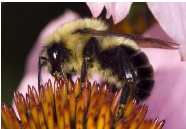
Bombus impatiens

Bumble bees are also unable to communicate the location of pollen and nectar sources the same way as honey bees. This can be an advantage of bumble bees as pollinators because an individual that finds a superior pollen or nectar source at a non-crop flower cannot communicate the location of that source to other colony members (Delaplane & Mayer, 2000). Because they cannot communicate well, they are less likely to get distracted away from the target crop.