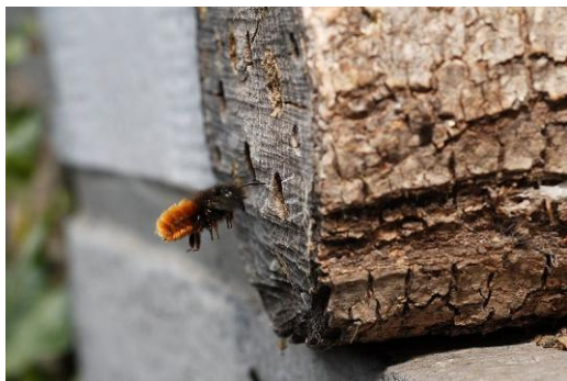
Osmia spp. entering her nest in a snag

A nest block is generally viable for a few years before there should be concern of parasites (WSU EMGP, 2010). At the end of the nesting season it is important to gently remove paper straws from the holes and relocate, including the bees, to an unheated location, such as a barn, garage, etc. (Mader et. al., 2011; WSU EMGP, 2010). Once the straws are removed, the blocks can be disinfected with a bleach solution (WSU EMGP, 2010). Make sure there are no air bubbles in the tunnels during the disinfecting process. Store the blocks for the winter once sanitation is complete. If disinfection of the nest blocks is too time consuming, consider creating new nest blocks each season (WSU EMGP, 2010).