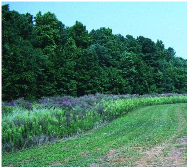
A good example of a field buffer with sun exposure, wildflowers, and proximity to other forage and nesting sites

The most important thing to remember when choosing a location for a new bee habitat is that ultimately its placement needs to be appropriate for the operation of the farm. Although bees have requirements and preferences for where the habitats are placed, in the end, the chosen location must be convenient and manageable for the farm. It would be counterproductive to establish a new bee pasture in the spring only to realize it is in the way of machinery or everyday farming operations and must be relocated for the next season.