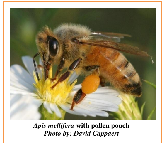
Apis mellifera with pollen pouch

One of the many reasons honey bees are used as commercial pollinators is that their nests are perennial (National Research Council, 2007). Unlike their unmanaged counterparts, honey bee nests survive the winter and the colonies do not restart each season (National Research Council, 2007). For this reason, it can be more economical to maintain honey bee hives, rather than purchase new bumble bee or mason bee colonies each growing season. Additionally, honey