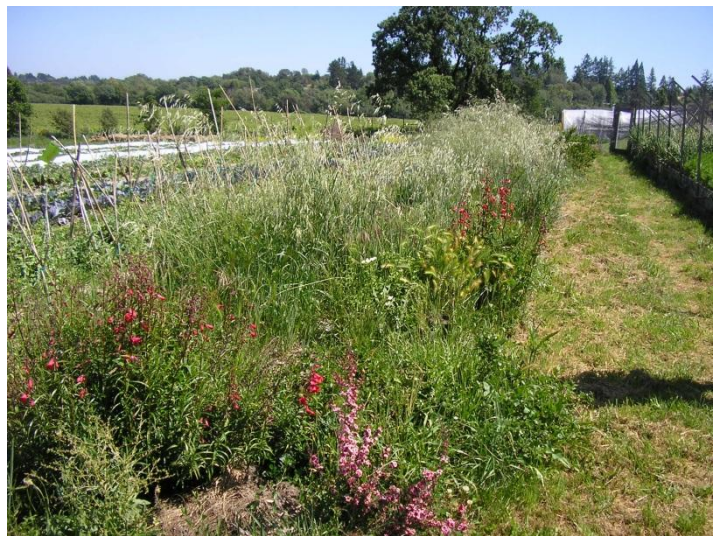
A blooming hedgerow with a mix of wildflowers, grasses, and forbs at Singing Frogs Farm

As the distance between nesting and forage habitats increases, the presence of pollinators and efficiency of pollination at those forage sites decrease (Ricketts et. al., 2008). This is