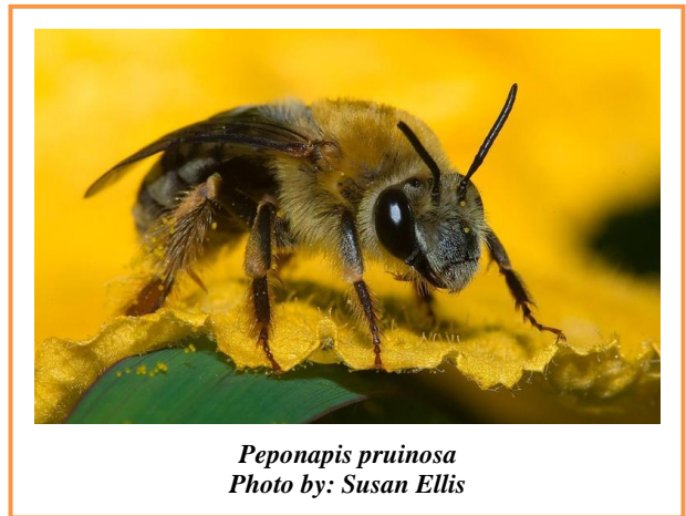
Peponapis pruinosa

As pollinators, squash bees begin pollination much earlier in the day than do other bee species (Wood, 2008). Once blooms close midday the squash bees become fairly inactive and return to their nests. Some males become trapped in the closed flowers and will even spend the night inside the closed flowers (Wood, 2008; Magrum & Magrum, 2013). Their life cycles are ultimately dependent on cucurbit blooms so they do not require year-round food sources (Surcică, 2011). Also, because of their proficiency and effectiveness in pollinating cucurbit crops, squash bees essentially eliminate the need for honey bees to pollinate these crops (Cane,