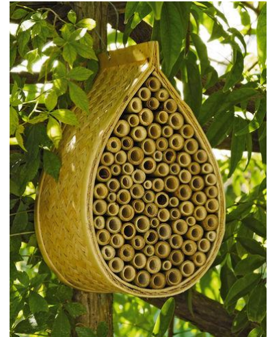
A commercially available stem bundle nest for bees

The emergence chamber should be a dark container with a single hole that is \frac{3}{8} inch in diameter drilled into the bottom of the container. Place the chamber outside, adjacent to the nest block, snag, or stem bundle (WSU EMGP, 2010). As the bees emerge from the straws inside the