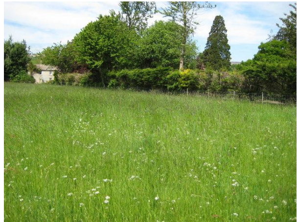
An un-mown field with wildflowers for forage and a diverse grassy landscape for pollinator nests