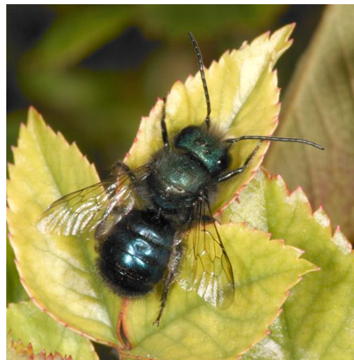
An Orchard Bee