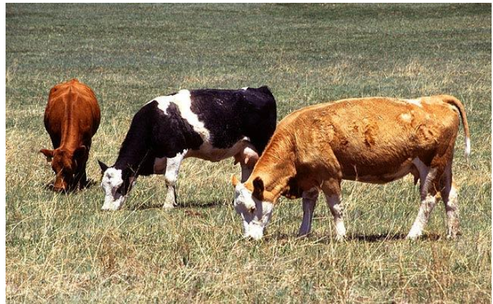
Grazing Cattle

In spite of these disadvantages, well-managed grazing can be an effective and beneficial way to increase pollinators on a farm. Utilizing manageable levels of rotational grazing throughout pastures or unused plots can help maintain open, blossoming plant communities that support a diversity of butterfly, bee, and other pollinator populations (Mader et. al., 2011). These open areas can be used for foraging habitats for pollinators as an alternative to creating a new foraging environment. This type of grazing is also an encouraging alternative to mowing any unused parcels of land on site.