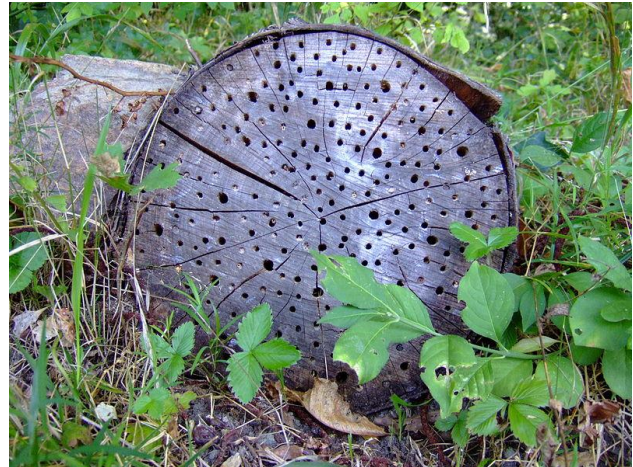
A large log with drilled holes is an example of a snag

It is also possible to create an artificial snag if aesthetics and safety of natural snags are an issue. Create an artificial snag by drilling holes of varying sizes into a log, then erecting it somewhere on site to imitate a fence post (Vaughan & Black, 2007). This arrangement can be a very attractive location for bees (Buchmann, 2002), especially if there is adequate sun exposure in the morning hours and throughout the day. Another option is to drill holes of various diameters into stumps, dead trees, and logs already present on the property (Buchmann, 2002; Mader et. al., 2011; National Research Council, 2007).