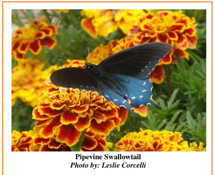
Pipevine Swallowtail

Flowers that are bright colors, including shades of red, pink, and purple, are the most attractive to butterflies (Ley, 2008). Unlike butterflies, who look for colorful flowers, moths prefer flowers that are pale or white in color (Ley, 2008). Because these insects have such long tongues, butterflies and moths tend to visit flowers with ample amounts of deeply hidden nectar. Butterflies use color patterns on the petals as nectar guides to find the nectar, similar to bees (Ley, 2008). Butterflies and moths also prefer long tubular flowers that have a faint, fresh, and sweet scent with a wide landing platform (Ley, 2008). Butterflies and moths do not have the same ability to carry large amounts of pollen like bees do, because they only drink nectar (H. Ginsberg, personal communication, April 2013), so they prefer flowers with lesser amounts of pollen.