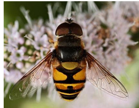
Drone Fly

The Ruby-throated hummingbird is the largest animal pollinator found in Rhode Island. Their requirements are very different than insect pollinators; however, they are relatively easy to fulfill. These birds are very adaptive and have been found living in grasslands, open woodlands, forests, gardens, meadows, and backyards (Cornell Lab of Ornithology, 2009). According to the Cornell Lab of Ornithology (2009), females tend to build their nests on slender branches of deciduous trees, such as oak, hornbeam, birch, poplar, or hackberry, and are generally found 10 to 40 feet above ground level. Although these birds do pollinate in Rhode Island and other parts